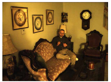
Figure 5 . Global motion estimation followed by local motion estimation refinement. Matching blocks with too high an error were excluded from the temporal sigma filter.

The previous result was improved by including a second local motion estimation and block exclusion step, using blocks of size 32 \times 32 . This result is shown in Figure 5.