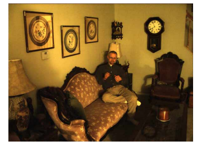
Figure 7. Noise reduction using both temporal filtering and spatial sigma filtering to blend regions that did not benefit from temporal filtering.

A final improvement (Figure 7) was achieved by including a spatial sigma filter step. Regions in which either five or six images contributed to the temporal sigma filter used a 3 \times 3 spatial sigma filter. Regions in which either three or four images contributed to the temporal filter used a 5 \times 5 spatial sigma filter. Regions for which only one or two images contributed to the temporal sigma filter.