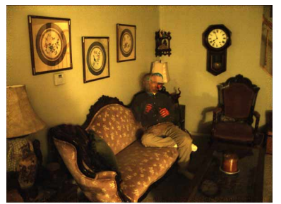
Figure 4 . Global motion estimation followed by temporal sigma filtering. Because of the low SNR of the signals, the sigma filter was unable to differentiate noise from different image content caused by motion.

The previous result was improved by including a second local motion estimation and block exclusion step, using blocks of size 32 \times 32 . This result is shown in Figure 5.