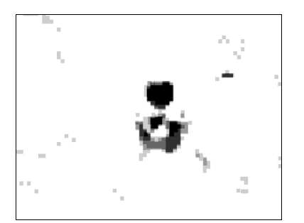
Figure 6. Map representing contributions to the temporal sigma filter. Most of the background regions used data from all six images (white regions) while some blocks near the person's hands and head used only the reference image and, therefore, achieved no noise reduction at all.

As can be seen, the ghosting artifacts were corrected by incorporating the local motion estimation that excluded blocks that were classified as poor matches. The region surrounding the person's head remained very noisy, a result of the fact that few if any frames provided successful block matches in that region. In cases where no frames provided a good match, the resulting region was equivalent to the original reference image region. Figure 6 shows a block exclusion map that represents the number of frames with successful block matches for a particular region. Black regions imply that no matches were found (only the reference image was included in the temporal sigma filter). White regions imply that all six images contributed data to the sigma filter.