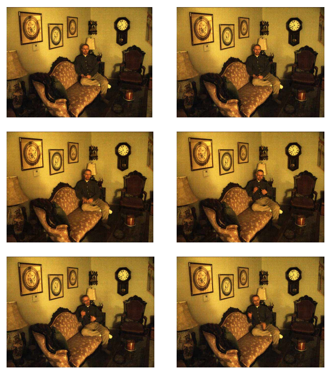
Figure 3. Six images with only gain factor applied. The reference frame in this example is the middle image in the right column.

Figure 3 shows small versions of all six images after the gain factor was applied. The reference image is the middle image on the right side. While the background is static for all six images, the person on the couch is moving from frame to frame.